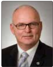
The Honourable Lyle Stewart Minister of Agriculture

I am pleased to present the Ministry of Agriculture's Operational Plan for 2017-18.